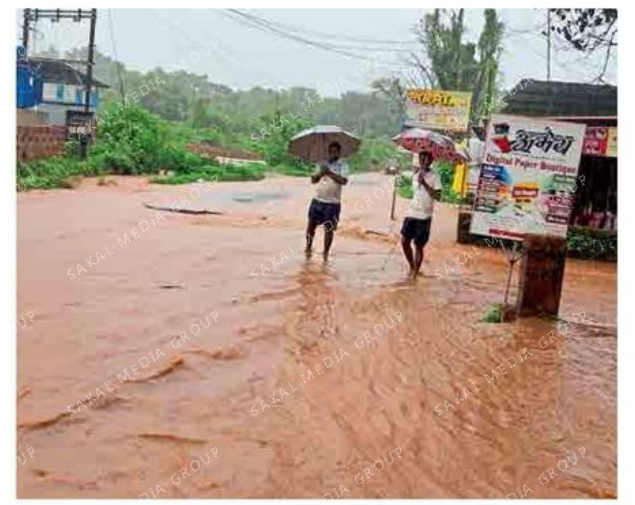
बांदा : येथे दोडामार्ग रस्ता पाण्याखाली गेला होता.