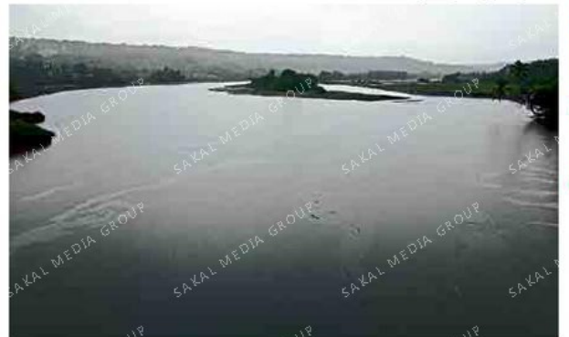
रत्नागिरी : मुसळधार पावसामुळे काजळी नदीने रौद्ररूप धारण केले होते.

मध्यरात्रीपर्यंत पावसाचे तांडव सुरू होते. याचा सर्वाधिक फटका रत्नागिरी