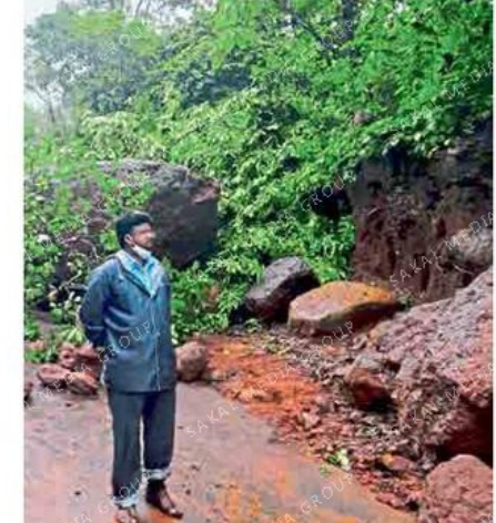
रतागिरी : हरचिरी येथे रस्त्यावर दरड कोसळली.